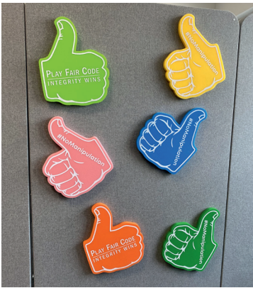
Colorful new thumbs