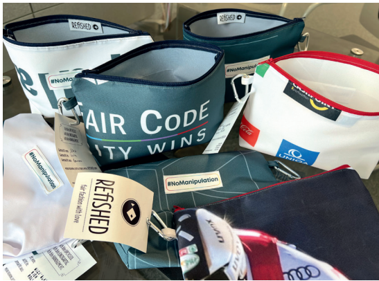
Upcycled bags from old roll-ups