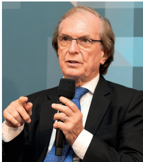
Friedrich Stickler President of Play Fair Code

“The Play Fair Code is definitely a very special organization and certainly a best-in-class example in the field of global initiatives to combat match-fixing. This was clearly demonstrated once again by the Play Fair Code Talks in Vienna. We very much appreciate that the Play Fair Code is on the side of the IOC and regularly supports and accompanies our initiatives and training offerings with its expertise.”