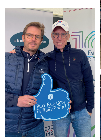
Austrian Day of Sports