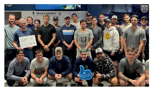
Fehervar AV 19

NUMBER OF TRAINING COURSES: 12 NUMBER OF PARTICIPANTS: 295 TRAINING COURSE LANGUAGE: English FORMAT: Presence