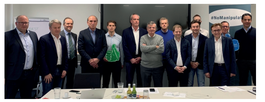
1. Play Fair Code Bookmakers Summit