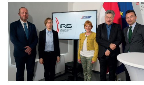
Opening Press Conference IRIS